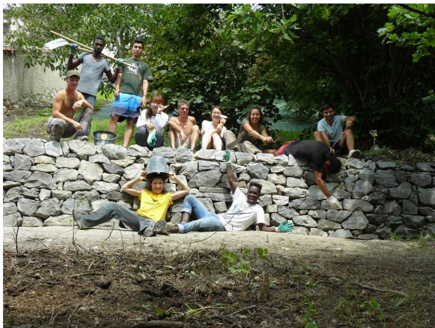
International workcamp in Auvergne