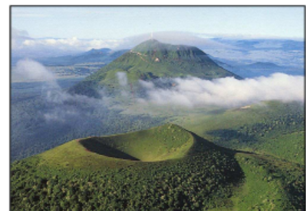
Volcanoes of Auvergne