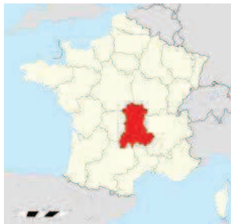
Location of Auvergne in France