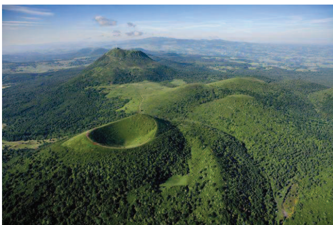
Volcanoes in Auvergne