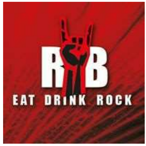
K1 Club A small Club in Amstetten with Disco Feeling ;-)