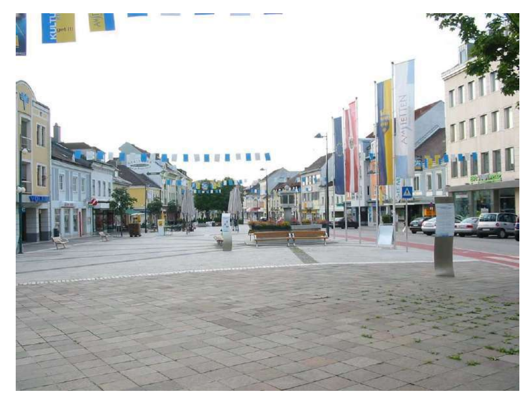
The town hall in Amstetten