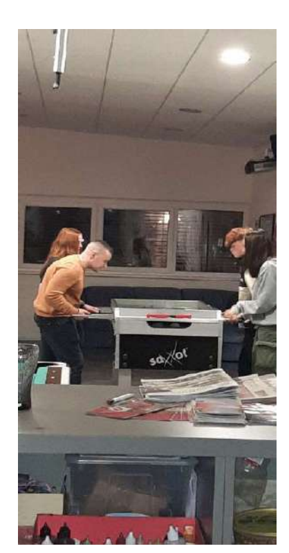
Games in A - Toll