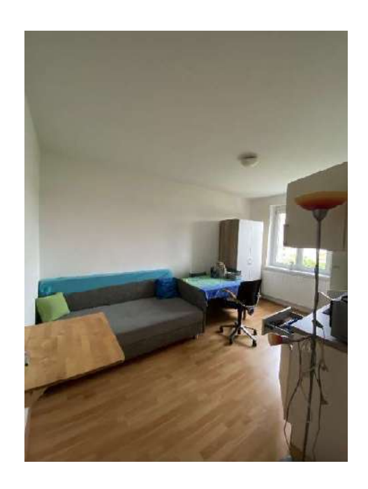
Living area + kitchen.